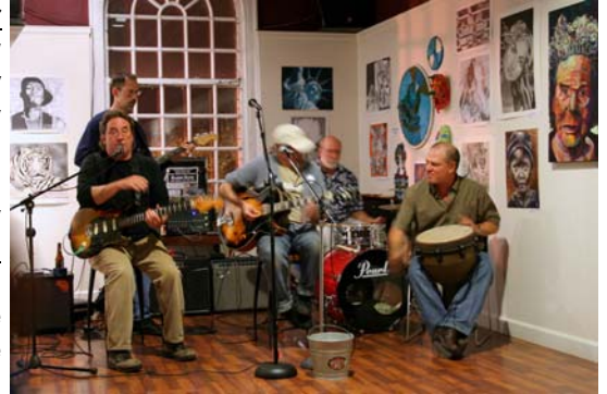
Friday night Blues jam at Beloit Fine Arts Incubator

Saturday nights: Here again you have options. For us it typically depends on what the college is serving up from their International Performing Arts Series . They'll bring in world class performances from across the globe. If the college is presenting something, that's where we'll be. You just need to see their schedule to get a sense of the breadth and renown of what the College provides the community. From BeauSoleil to The St. Petersburg String Quartet and all points in between, all here to enjoy in Beloit WI. Additionally the Beloit Janesville Symphony performs at Beloit College throughout the year.